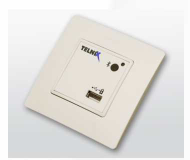
Wall mount "Schuko" type; Other enclosing can be studied.